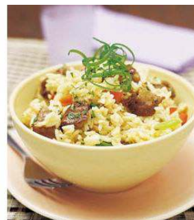
Typical Thai Rice & Lamb dish