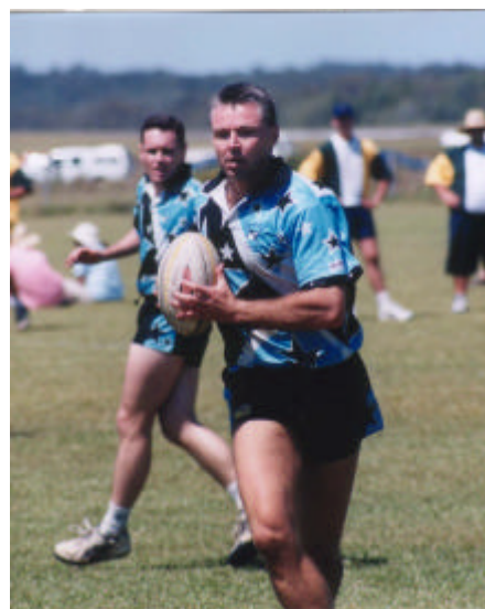
Playing for his beloved Cronulla

Another enormous challenge was going to NZ in 1998 after losing the Trans Tasman the year before in Brisbane. In the first test in Auckland on Friday night as you know, we tried some different things and were soundly beaten.