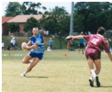
NSW Mens Open 1996